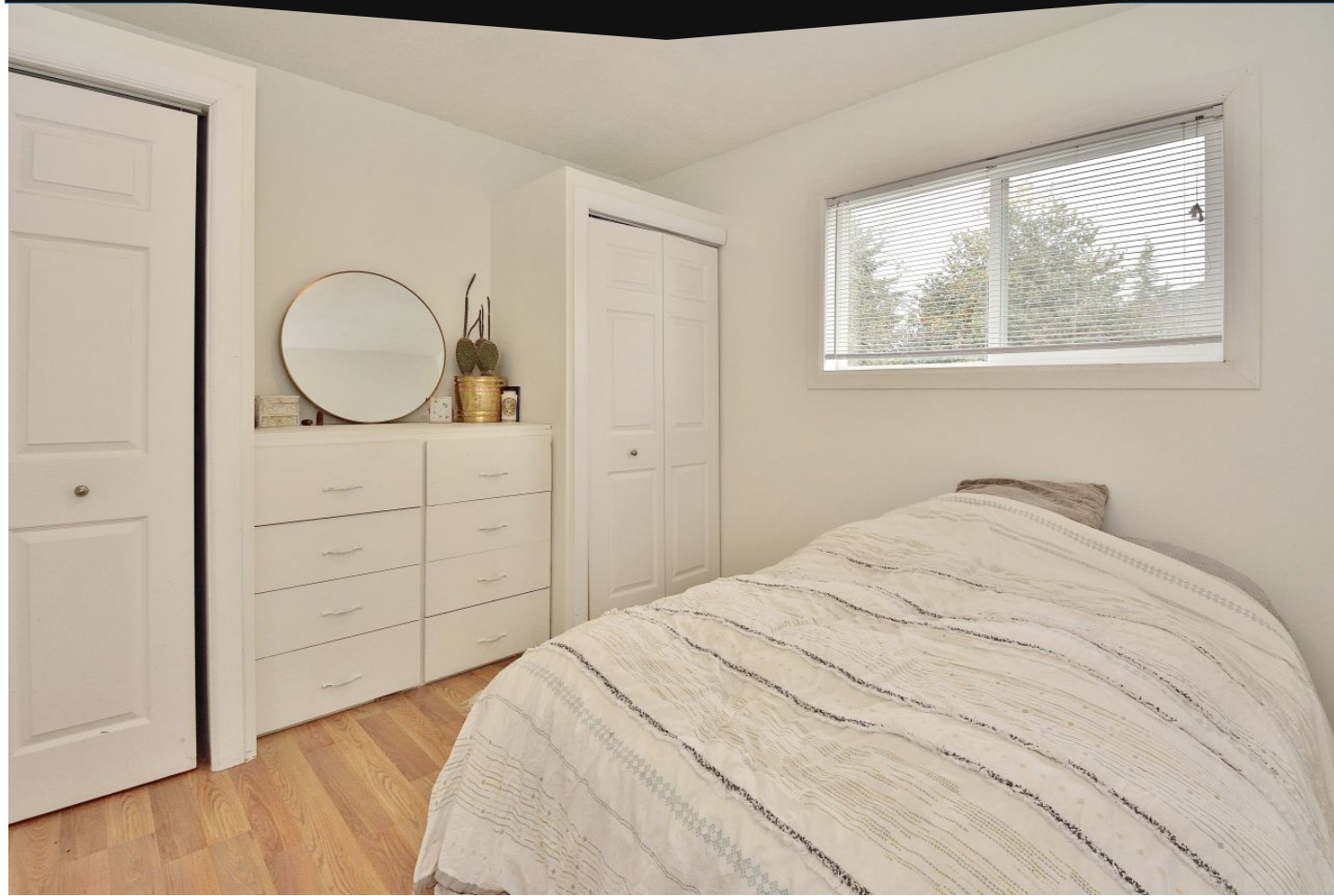
Built in Dresser in Main Bedroom