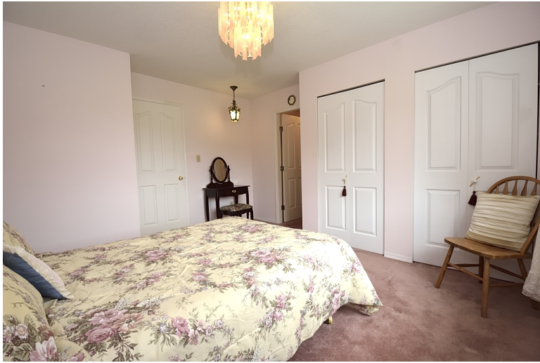
The Master Suite as double closets, plus another walk-in closet, and ensuite. It also has a stunning view of the lake.

Through the Master bedroom walk-in closet, you will find this immaculately kept ensuite. With it's leaded glass door and curved tub and vanity, it has loads of potential for the creative mind.