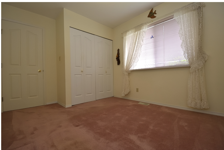
The second main floor bedroom.