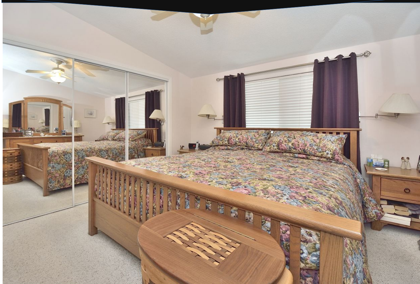
Master Bedroom with Ensuite & soaker Tub