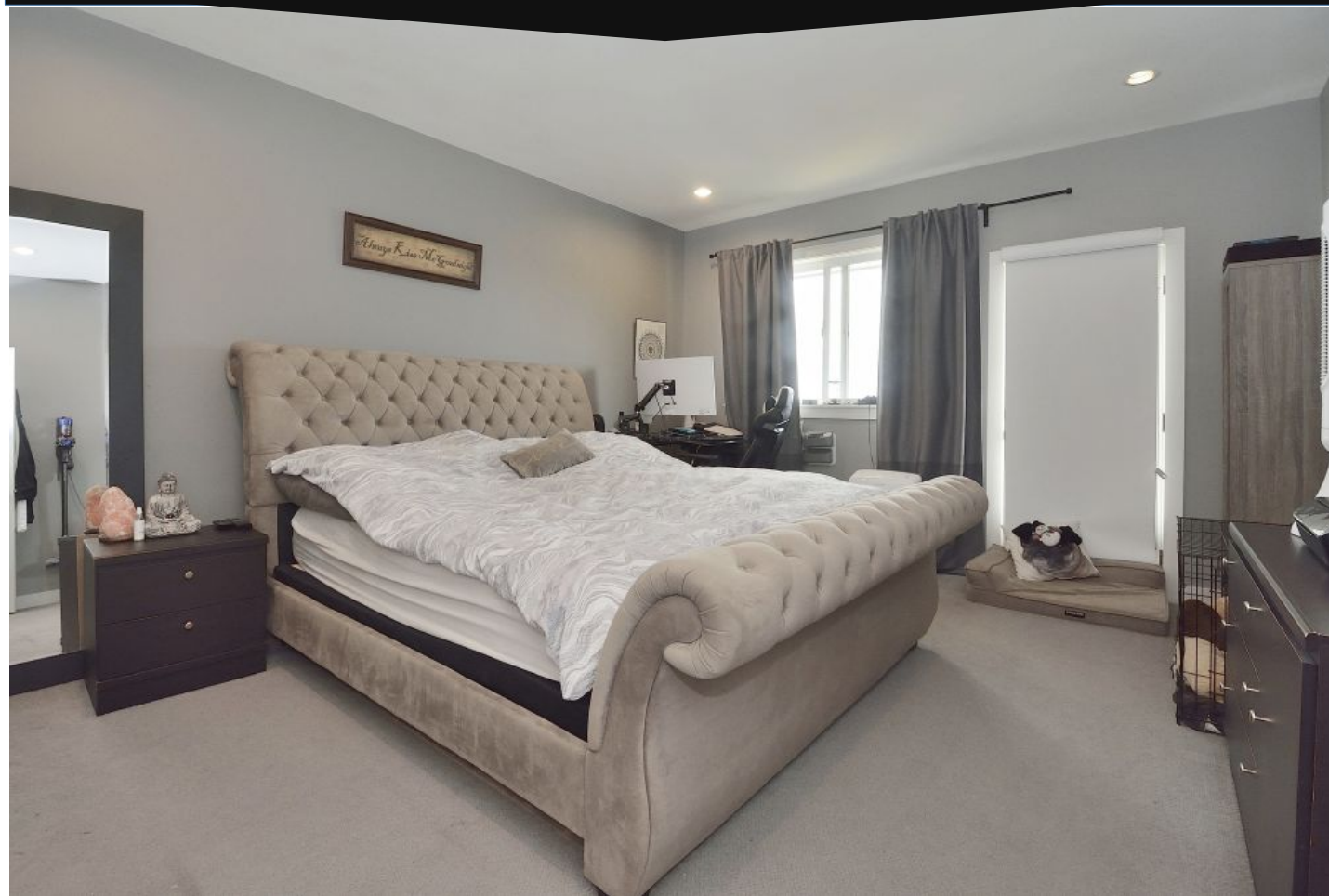
Nice sized Main Bedroom